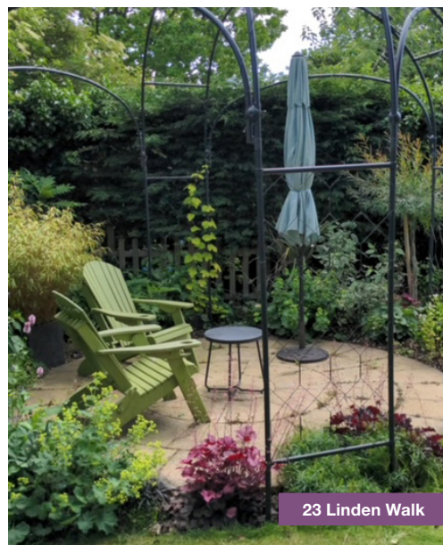
23 Linden Walk