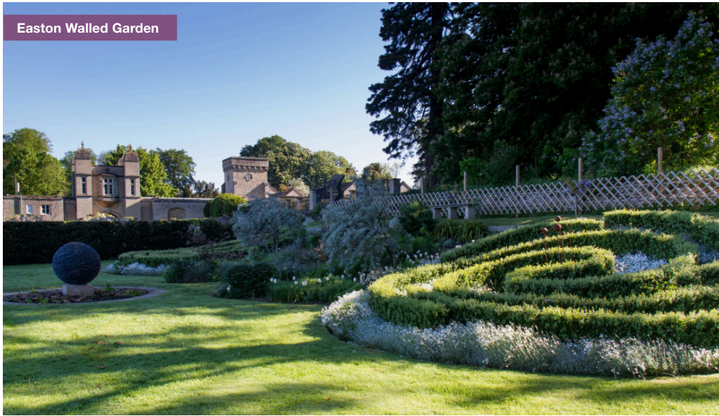
Easton Walled Garden